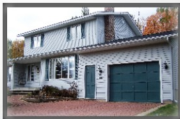
16 Aitken Avenue Energy Efficient & immaculate!