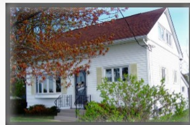
219 Sweeney Lane Cozy home with sunporch!

A special thank you to a special group of people - YOU! Thank you for helping me realize my goal of TOP PRODUCER! in Miramichi & Northumberland County for the second year in a row. Please continue sending me your referrals, I am just a phone call away. You make my business grow and I appreciate all you do. I look forward to your business in 2010!