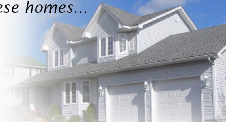
7 Demers NEW PRICE!!!