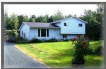
179 Route 425 South Esk Quiet lovely surroundings!